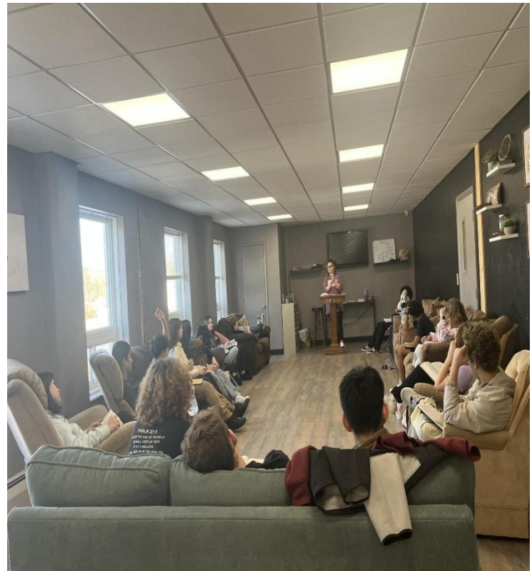
Summit Youth engage in the lesson taught by the youth leaders.

SUMMIT meets on Sunday evenings from 5-7:30pm. This is for grades 6-12.