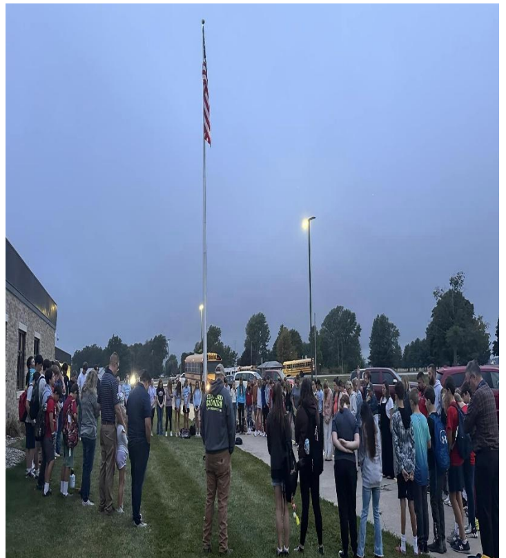
"See You At The Pole" 2024 at Lewis Cass High School.

SUMMIT meets on Sunday evenings from 5-7:30pm. This is for grades 6-12.